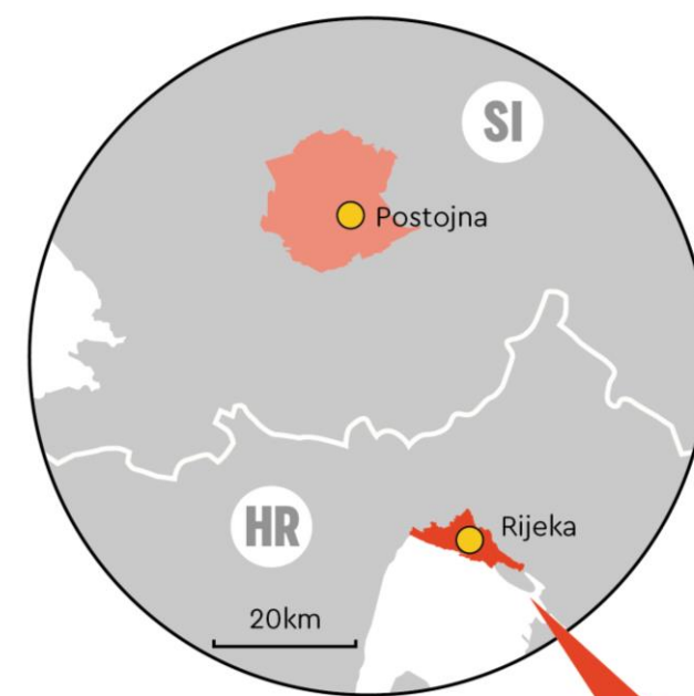
HR/SI – City of Rijeka partnering with Municipality of Postojna